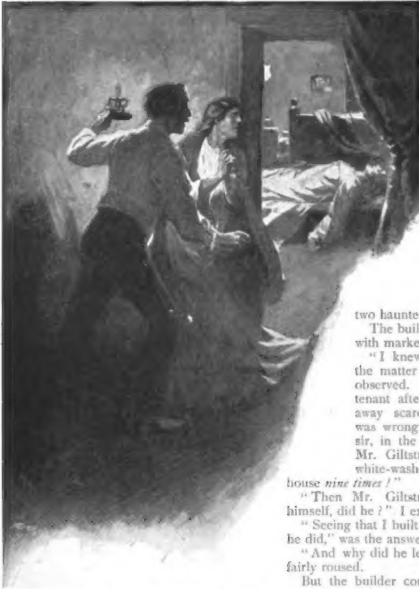
The gas had been turned full on, and by its light I saw the girl lying stretched on a couch at the foot of the bed.

breakfast what had occurred, as minutely as possible. She was profoundly impressed.